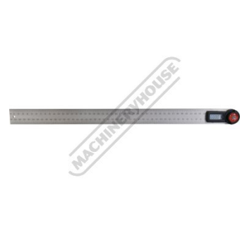
zero degree view