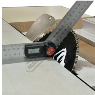
Shown Measuring Blade Angle