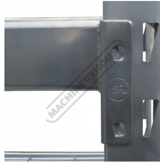
External Shelf Locking System