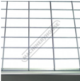
Shelf Wire Mesh