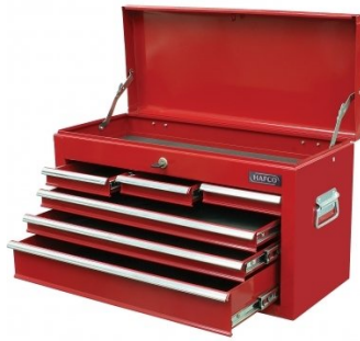
T690 Workshop Series Tool Chest