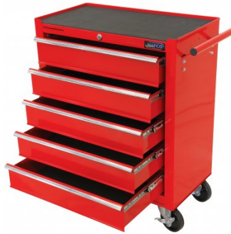
T695 Workshop Series Roller Cabinet