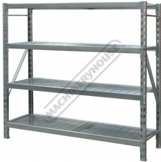
RSS-4WS Industrial Shelving