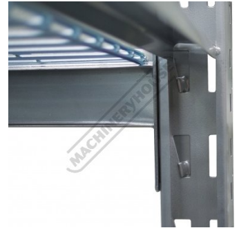
Internal Shelf Locking Wedge Type System