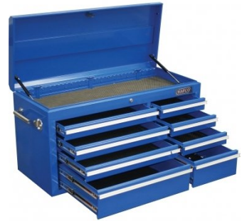
T720 Industrial Series Tool Chest