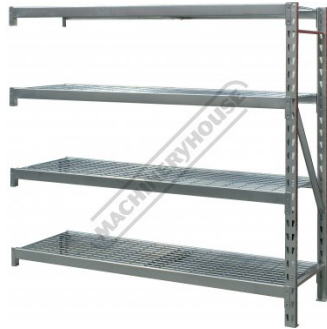
RSS-4WSA - Industrial Steel Shelving Extension