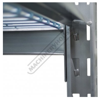
Internal Shelf Locking Wedge Type System