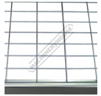
Shelf Wire Mesh