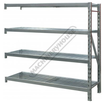
RSS-4WSA - Industrial Steel Shelving Extension