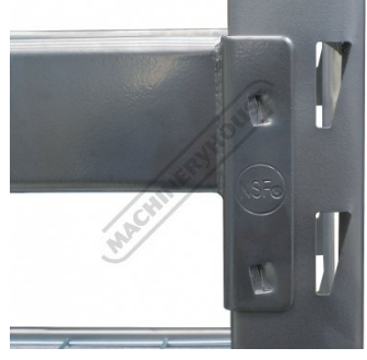
External Shelf Locking System