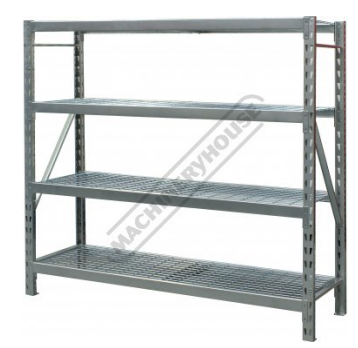
RSS-4WS Industrial Shelving