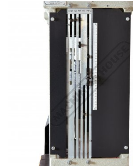
Adjustable Travel Limit Control