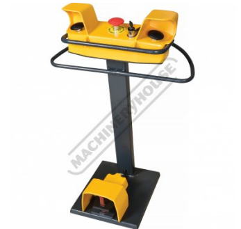
Foot Pedal Control