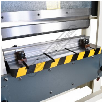
T Slotted Bottom Table