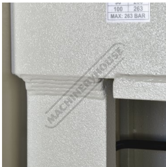
Heavy Duty Steel Welded Frame