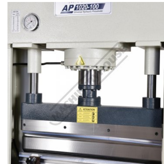
2 x Guide Pistons