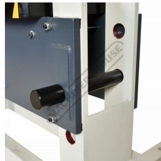
Adjustable Table Height