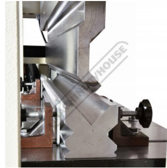
Multi vee Die Block