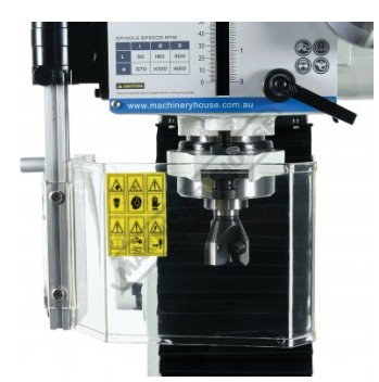
Swivel Safety Guard