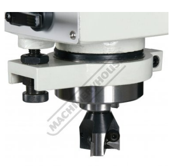
Includes Face Mill Cutter