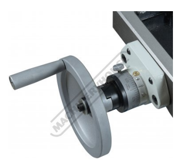
Table Longitudinal Dial