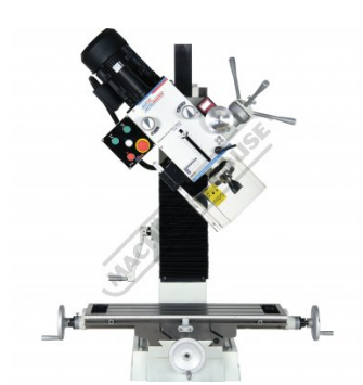
Tilting Head Left