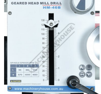
Quill Depth Stop Scale & Spindle Lock