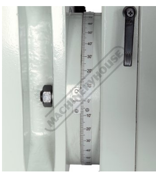
Tilting Head Scale