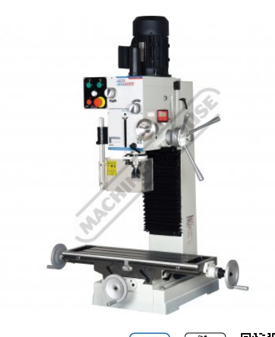
Table Travel: (X) - 485mm (Y) - 175mm (Z) - 430mm Includes Dovetail Column