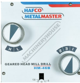
Spindle Speed Selectors