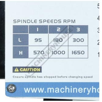
Spindle Speed Chart