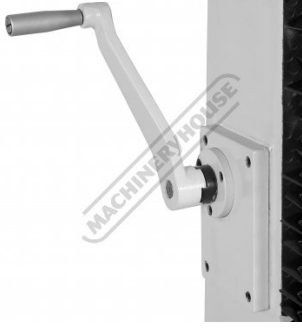
Rack & Pinion Wind Up Head