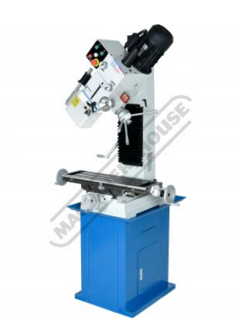
Shown On Optional Stand