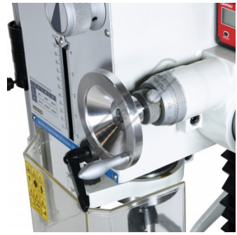
Fine Quill Feed Handwheel

sales@machineryhouse.com.au www.machineryhouse.com.au