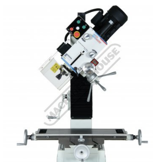
Tilting Head Right