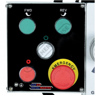
Forward Reverse ON OFF-Emergency Switches