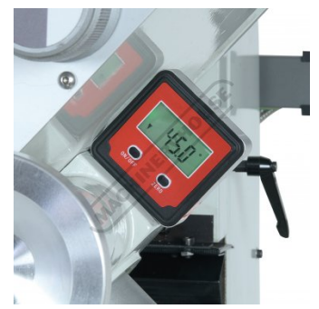
Digital Tilting Head Gauge