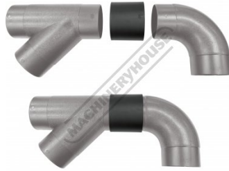
Shown Connecting Dust Fittings Together