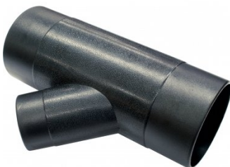
W3375 Dust Hose Y Adaptor