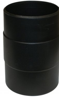
W334B Dust Hose Joiner