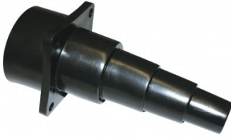
W334A Dust Hose Stepped Reducer