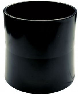
W3395 Quick Connect Adaptor