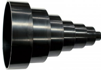
W3346 Dust Hose Stepped Reducer