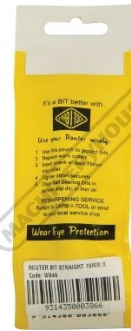
Packaging Rear View