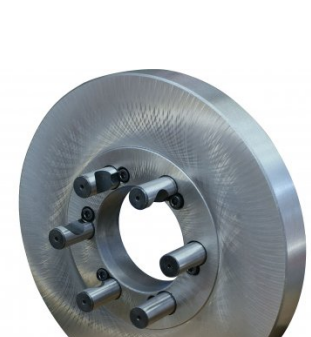
L286 D1-8 Camlock Back Plate