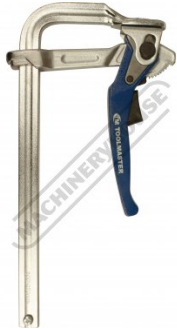
Shown Fully Closed