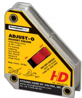
W1006 Adjust-O Magnet Square - Heavy Duty