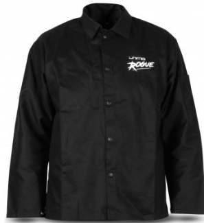
W1003 ROGUE™ PROBAN® Welding Jacket