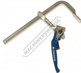
Shown with Ratchet Fully Open