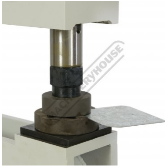
Shown Pressing a Corner Radius