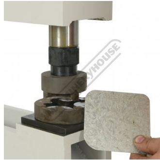
Material Showing Corner Radius