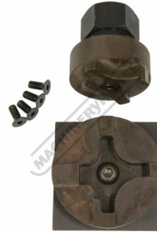
Top & Bottom Die Set