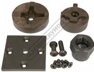
Top & Bottom Die Set 3