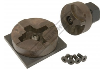
Top & Bottom Die Set 2