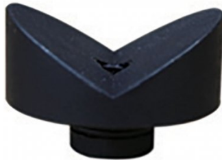
W08014 BuildPro V-Block