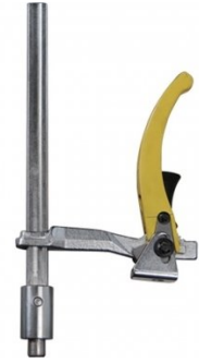
W07910 BuildPro Inserta Clamp