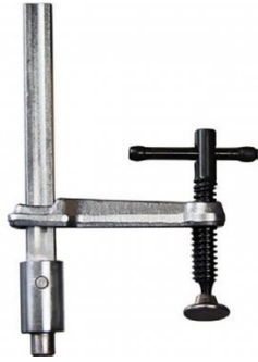
W07906 BuildPro Inserta T-Handle Clamp