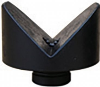
W08010 BuildPro V-Block