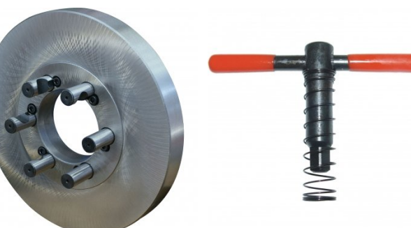
C2864 Chuck Key