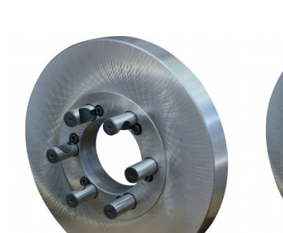
L2875 D1-5 Camlock Back Plate