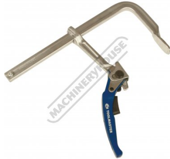
Shown with Ratchet Fully Open