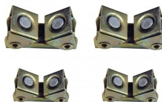
W1021 Magnetic V-Pad Kit - (4 Pack)