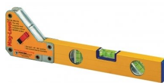
W1020 Magnetic Level