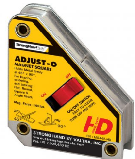
W1006 Adjust-O Magnet Square - Heavy Duty