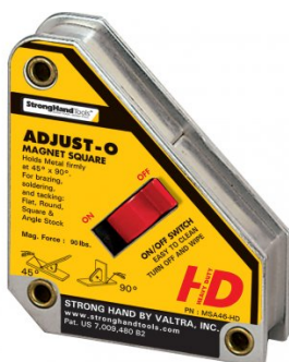
W1007 Adjust-O Magnet Square - Heavy Duty