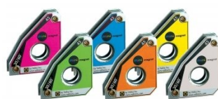
W1008 Mini Magnet Squares - (6-Pack)