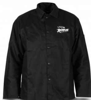
W1003 ROGUE™ PROBANS® Welding Jacket