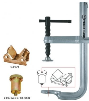
W1025 4 In One Utility Clamping System