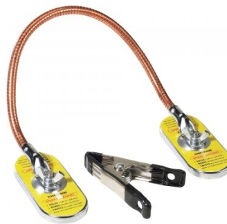
W1005 Snake Magnet & Spring Clamp