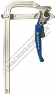
Shown Fully Closed