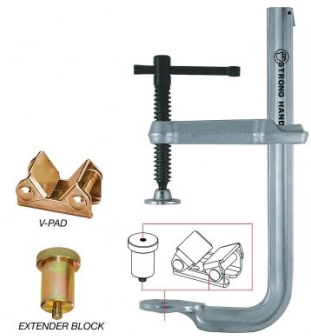
W1026 4 In One Utility Clamping System