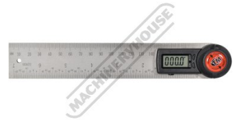
Zero Degree View