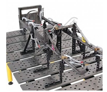
Shown with Optional Accessories Setting Up Frame 2 Shown with Optional Accessories Setting Up Frame 3 Shown with Optional Accessories Setting Up Frame 4 Shown with Optional Accessories Setting Up Frame 5