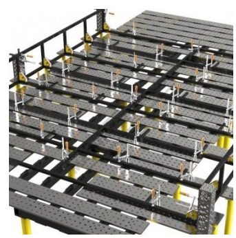
Shown with Optional Accessories and Joining Multipe Tables