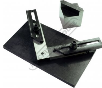
Parts View 2