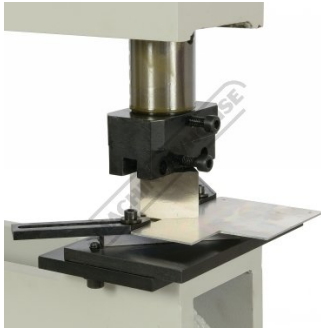
Shown Notching Material