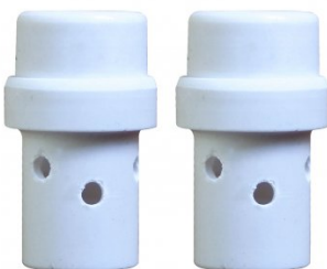
W558 Swan Neck Assembly