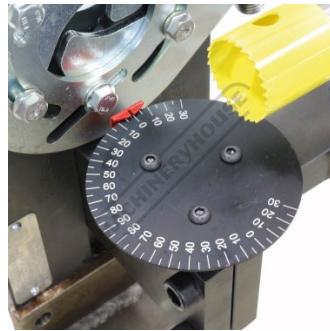
Large Engraved Degree Dial