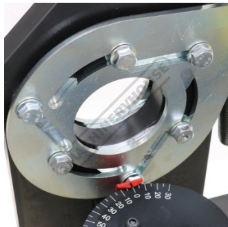
Self Centering Vice Shown Open