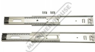
Ball Bearing Slides