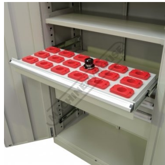
Shown Mounted To Optional Cabinet