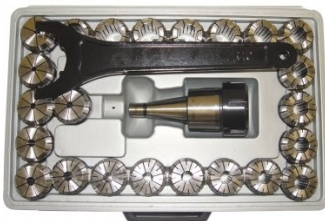
C966 Collet & Chuck Set - 25 Piece