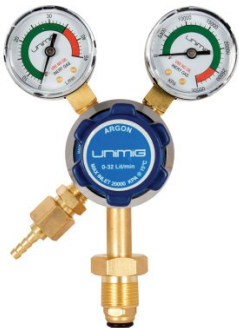
W160A Argon Gas Regulator-Twin Gauge