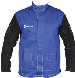
W1001A Promax Blue FR Welding Jacket