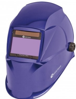
W002 Auto Darken Welding Helmet - 9-13 Shade