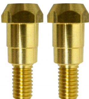
W557 2 Contact Tip Holders