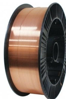
W135 Ø0.9mm Mild Steel MIG Welding Wire