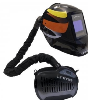
W159 Auto Darken Welding Helmet with PAPR Respiratory System - 5-9, 9-13 Shade