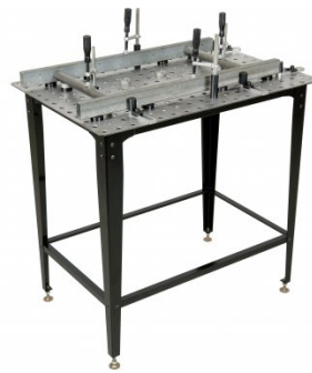
W07706 Welding Table with Square & Round Tube Clamp Kit