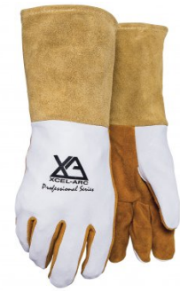
W101 TIG Welding Gloves - 310mm