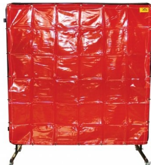
W225 Welding Curtain