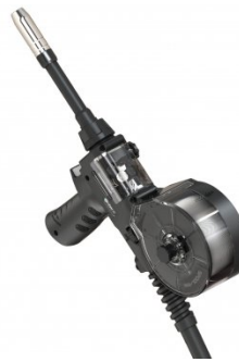
W181C Spool Gun - Light Duty