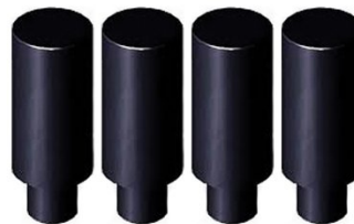
W08515 38mm Material Stop (Spigot Type)