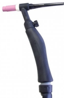
W171D Air Cooled TIG Welding Torch