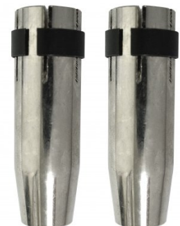
W555 2 x Conical Nozzles