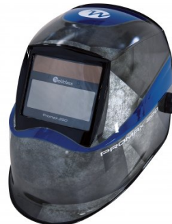
W001 Auto Darken Welding Helmet - 9-13 Shade