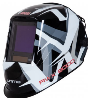
W005 Auto Darken Welding Helmet - 5-13 Shade