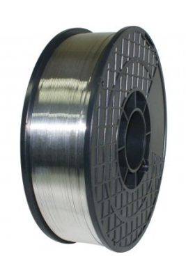
W144 Ø1.2mm Aluminium MIG Welding Wire