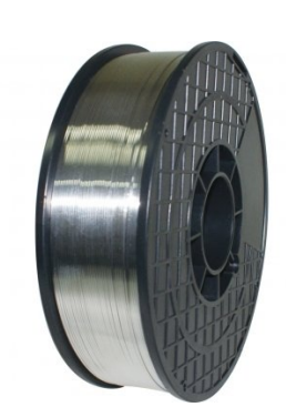
W143 Ø1.0mm Aluminium MIG Welding Wire