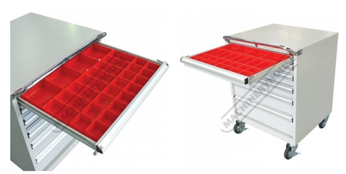
Top Drawer with Plastic Buckets

sales@machineryhouse.com.au www.machineryhouse.com.au