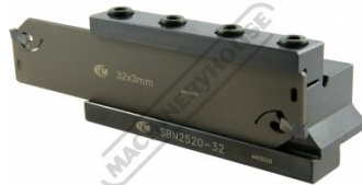
Front Rear View