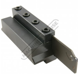
Rear Top View