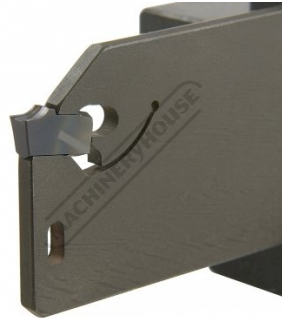
Tip Close Up