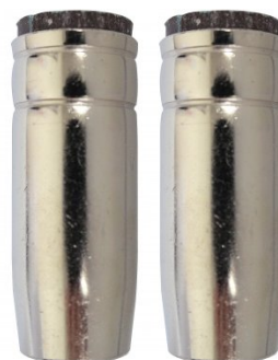
W560 2 x Conical Nozzles