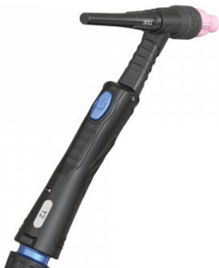
W171C Air Cooled Arc Torchology® TIG Welding Torch