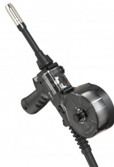
W181C Spool Gun - Light Duty