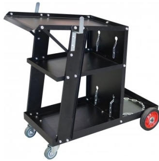
W241 Welder Trolley