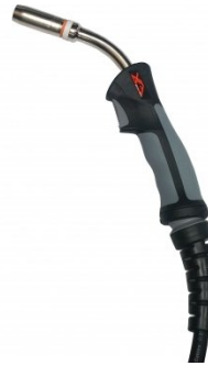
W559 MIG Torch - 4 Metre