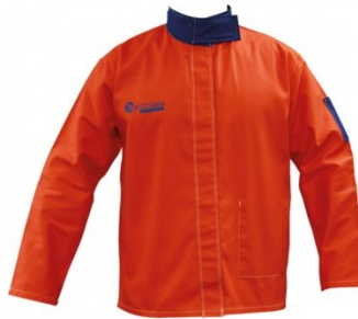
W1000A Promax HV5 Welding Jacket