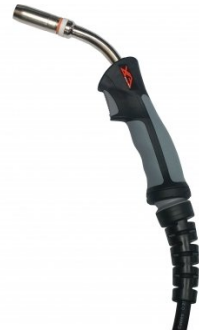
W559A MIG Torch - 3 Metre