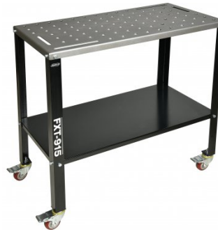
W08450 FIXTURE TABLE