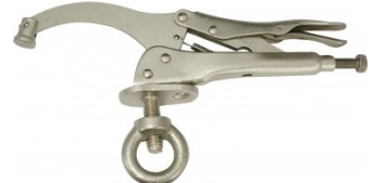
C103 9" Drill Press Locking Clamp