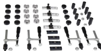
W08500 Square & Round Welding Table Clamp Kit