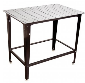
W07706 Welding Table with Square & Round Tube Clamp Kit