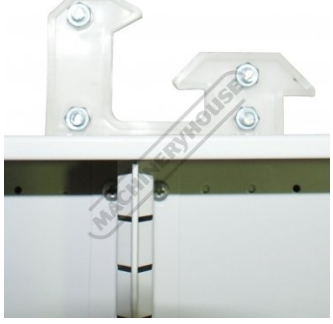
Drawer Lock Bracket