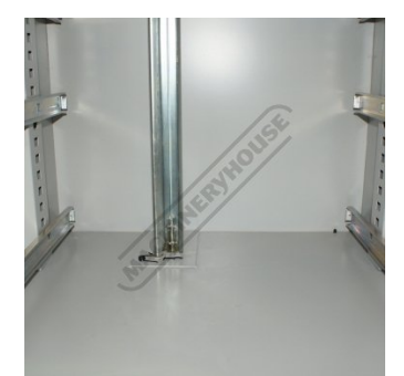
Drawer Locking Mechanism