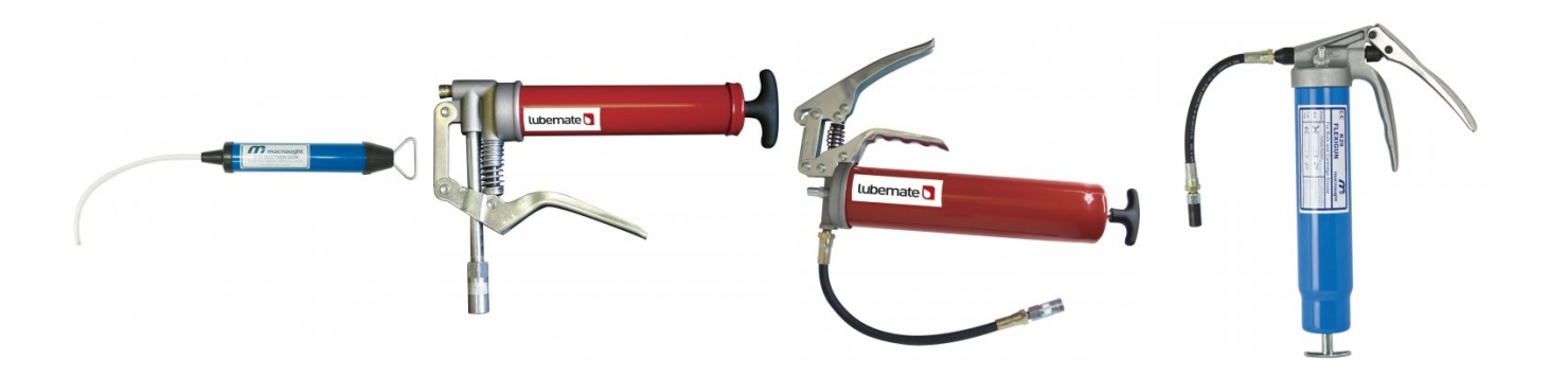
G063 Grease Gun