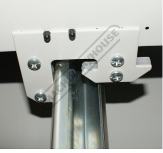
Drawer in Lock Position