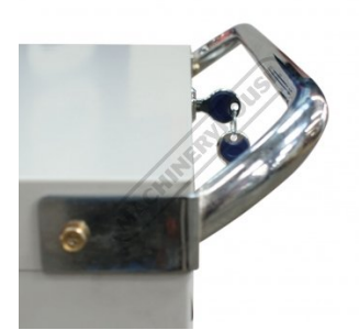
Heavy Duty Push Handle