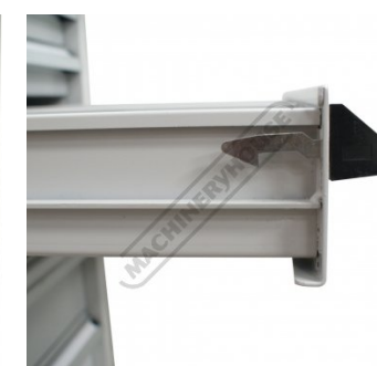
Drawers with Safety Lock