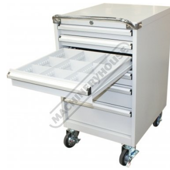
Heavy Duty Drawers with 100kg Load Capacity