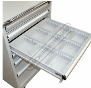
Drawers with Steel Dividers