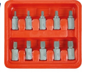
T119 Metric Thread Restorer File