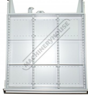
Heavy Duty Drawers