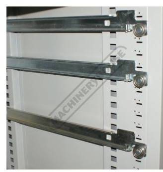
Heavy Duty Drawer Slides