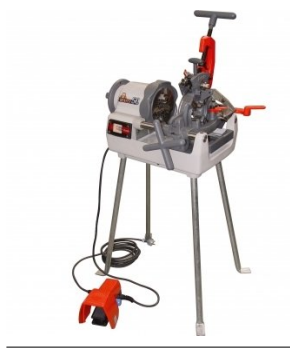
T023 Pipe Threading Machine -Automatic Die Head