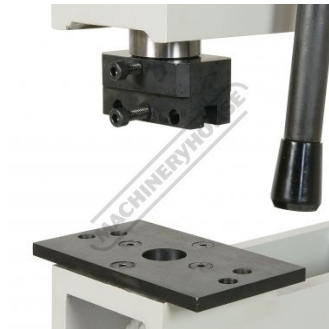
Press Clamp and Table