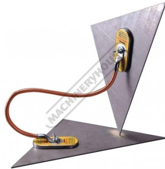
Shown In Use 2