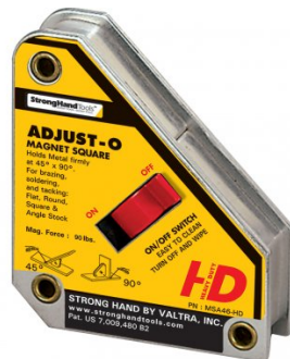
W1007 Adjust-O Magnet Square - Heavy Duty