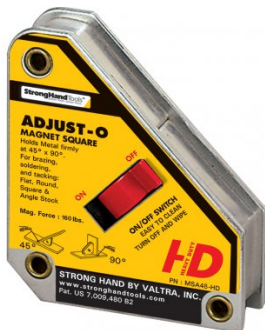
W1006 Adjust-O Magnet Square - Heavy Duty