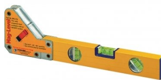
W1020 Magnetic Level