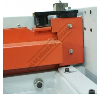
Material Clamp Front View