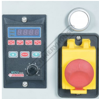
Speed Control and On Off Safety Switch