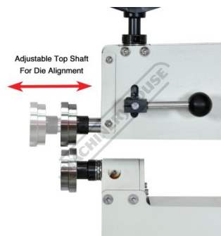
Adjustable Top Roller