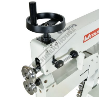
Upper Mandrel Adjustment Handle