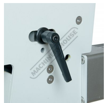
Locking Levers For Top Shaft Die Alignment