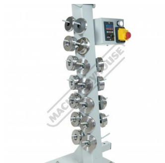
Die Rack Holders Left View