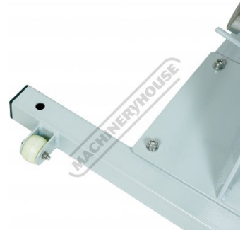
2 X Rear Wheels For Mobility