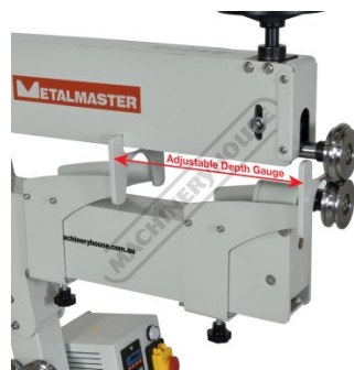
Adjustable Depth Gauge