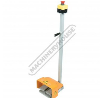
Forward & Reverse Foot Control With Emergency Stop Switch