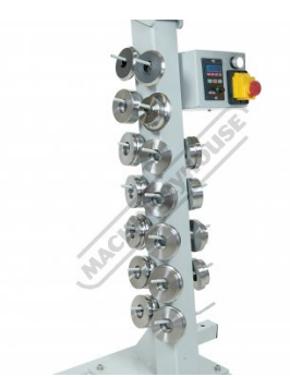
Die Rack Holders Left View