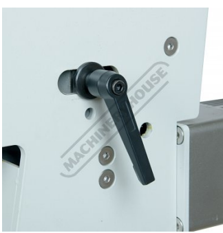
Locking Levers For Top Shaft Die Alignment