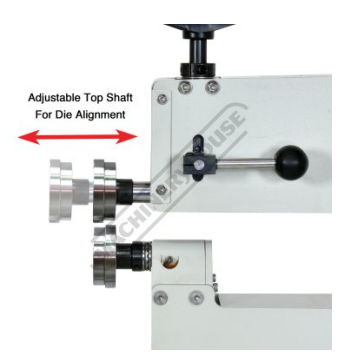
Adjustable Top Roller