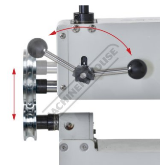
Quick Release Lever