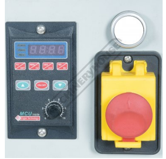
Speed Control and On Off Safety Switch