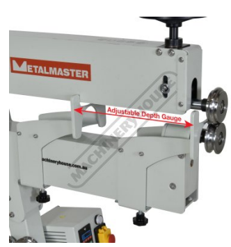
Adjustable Depth Gauge