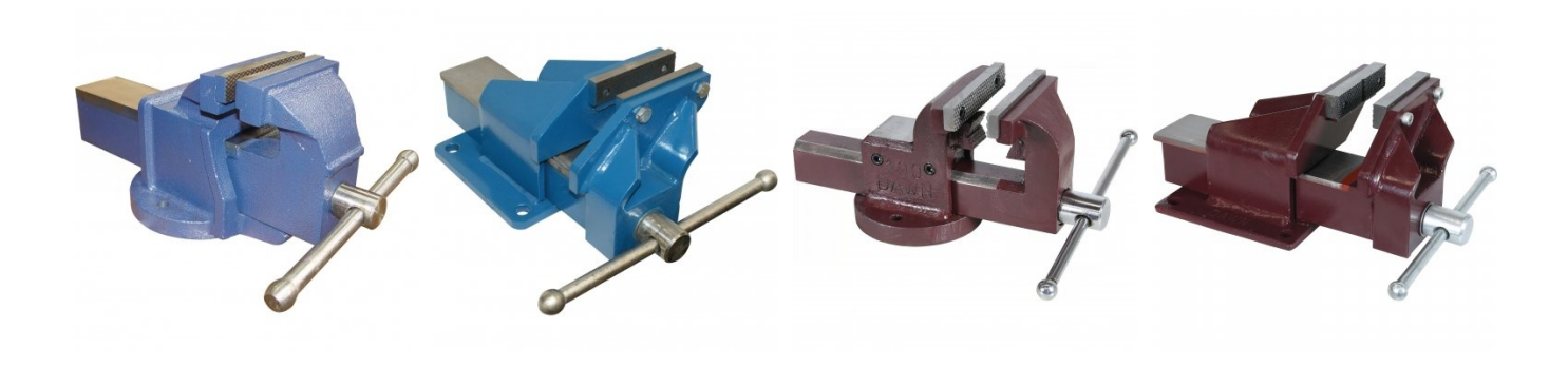
V069 Steel Offset Fabricated Bench Vice - Right Hand