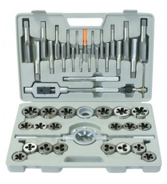
T015 Imperial Alloy Steel Tap & Die Set - 45 Piece