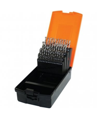
D1071 HSS Sheet Metal Step Drill Set - 3 Piece