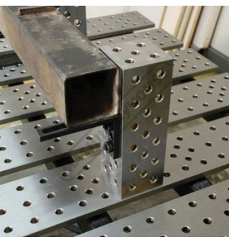
Right Angle Brackets can be Monted to the Riser Blocks to Hold at Varying Heights