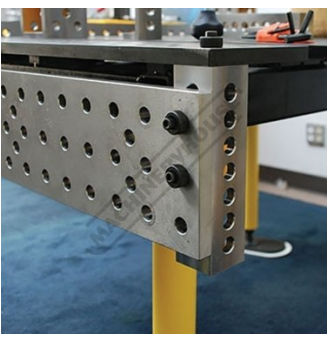
Riser Block Used to Mount BuildPro Plate in Vertical Position