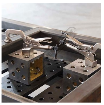
Table Mount C Clamps can Be Mounted to the Riser Blocks for Push Down Clamping for Taller Workpieces