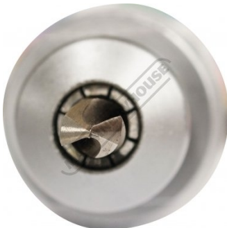
Sharpened Drill Bit with Split Point