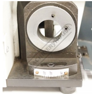
Drill Angle Setting