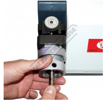
Setting up Drill for Sharpening