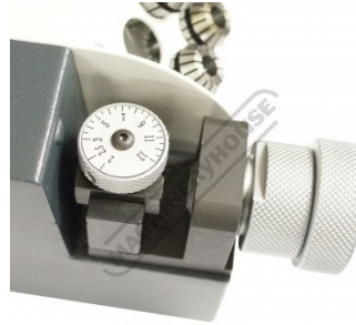
Drill Setting Gauge