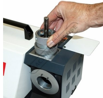
Grinding Split Point Station