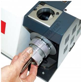
Sharpening the Drill Bit Station