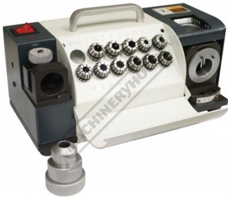
ER20 Collet Set Storage