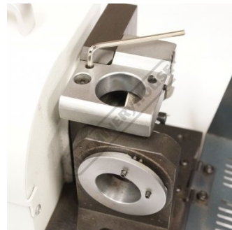
Setting the Centre Point Adjustment Screw