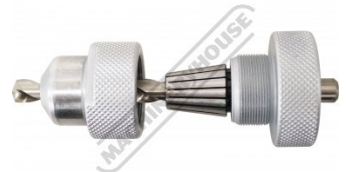
Collet Chuck Drill Holder