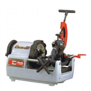
T024A Pipe Threading Machine -Automatic Die Head