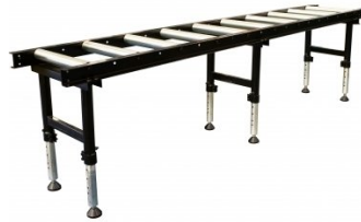
L830 Roller Conveyor with Adjustable Stands - Heavy Duty