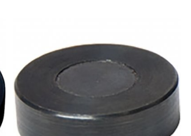
W08026 BuildPro Ecentric Pad