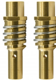
W537 2 x Contact Tip Holders