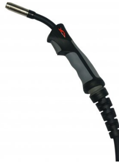
W542 MIG Torch - 4 Metre