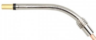
W541 Swan Neck Assembly