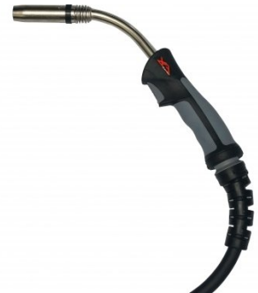
W571 MIG Torch - 4 Metre