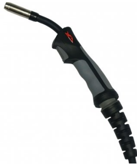
W542A MIG Torch - 3 Metre