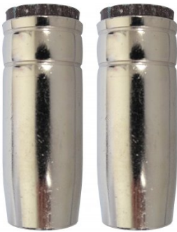
W560 2 x Conical Nozzles