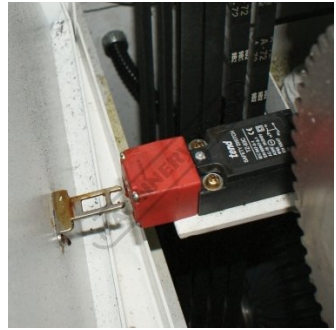
Safety Micro to Belt Cover