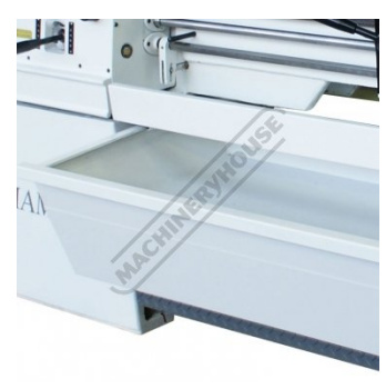
Slide out tray for easy cleaning