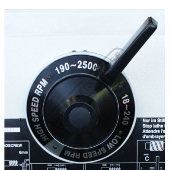
Speed Control Lever