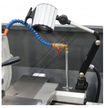
Coolant Nozzle and Work Light