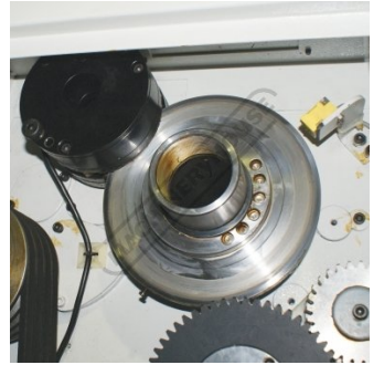
Electro Magnetic Disc Brake