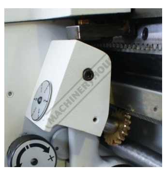
Thread Chasing Dial