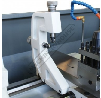
2 Point Travelling Steady