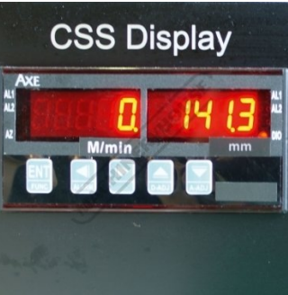
Constant Surface Speed Digital Read Out Spindle Speed Digital Read Out