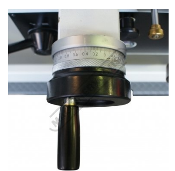
Cross Slide Handle