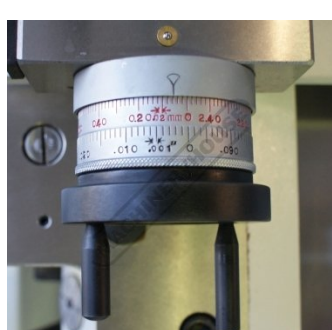
Cross Slide Handle