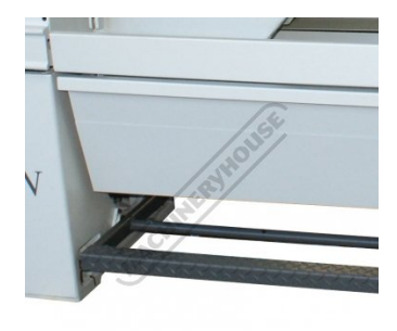
Mechanical Foot Brake