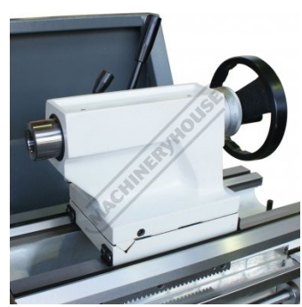
Heavy duty tailstock