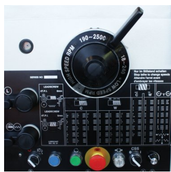
Feed Chart and Levers