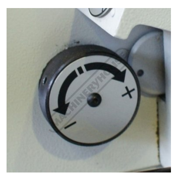
Adjustable Feed Torque Clutch

sales@machineryhouse.com.au www.machineryhouse.com.au