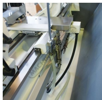
Scale for DRO