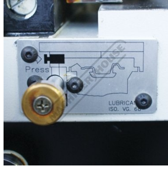
Lubrication pump for slide