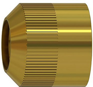
P8591 Hypertherm 125 Retaining Cap FlushCut