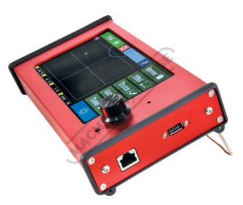
Import Via USB