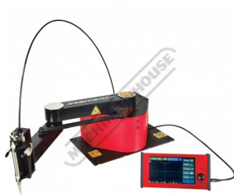
Setup With Trace Pen