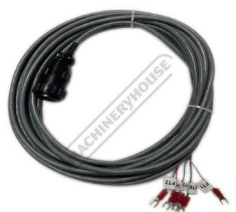
Universal CNC Cable