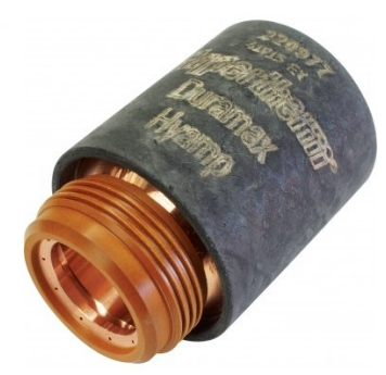
P852 Hypertherm 45A Nozzle