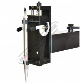
Trace Pen In Holder