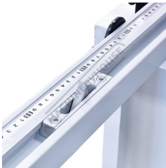
Flip Over Stop on Sheet Support