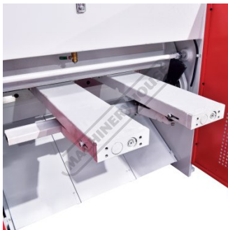
NC Leadscrew Backgauge System