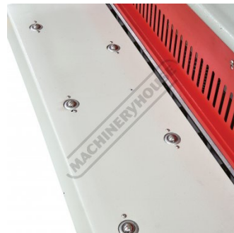
Material Transfer Balls On The Table