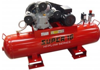
C345 Air Compressor