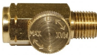
A219 Air Fittings