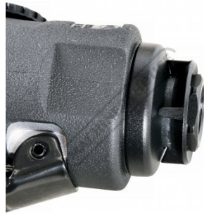
Rear Exhaust With Built In Silencer