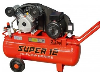
C340 Air Compressor