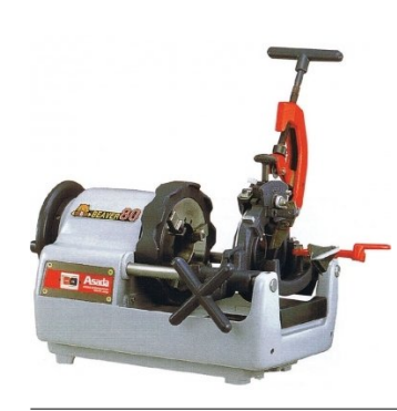
T024A Pipe Threading Machine -Automatic Die Head