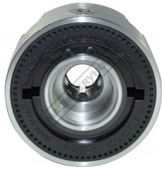
Shown With Faceplate Ring 62572 Indexing Plate - 72 Holes, 5 Degree Intervals