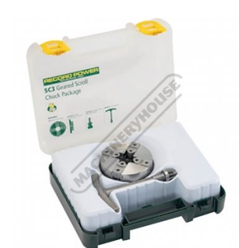
Shown In Case