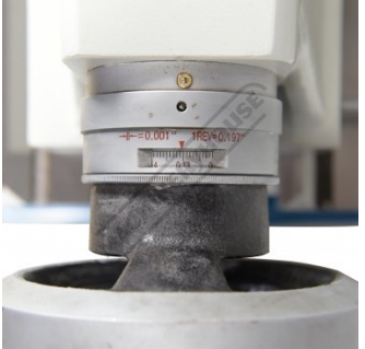
Tailstock Dial in Imperial Mode