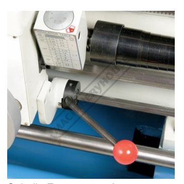
Spindle Engagement Lever