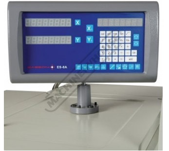
2 Axis Digital Readout