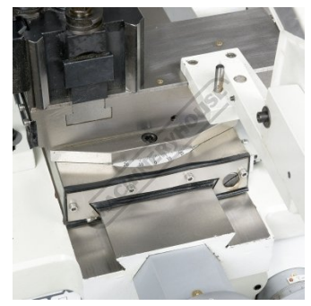
Compound Angle Scale