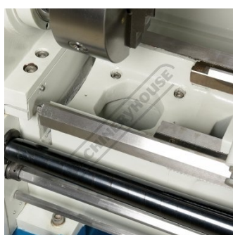
Removable Gap Bed