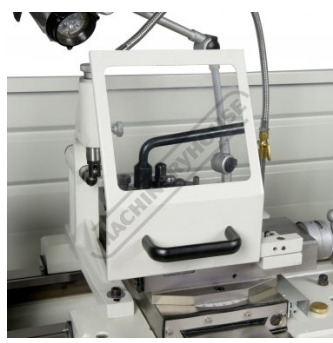
Saddle Safety Guard