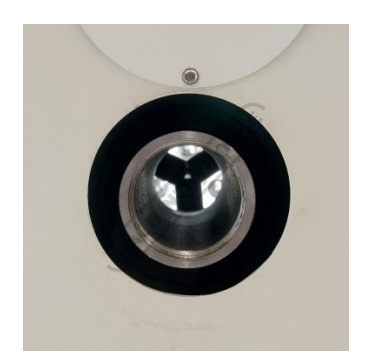
58mm Spindle Bore