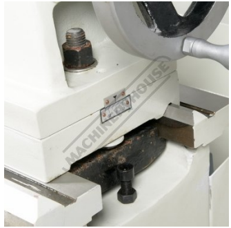
Tailstock with Adjustable Horizontal Movement Tailstock Dial in Metric Mode