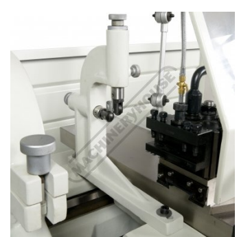
Travelling Steady With Roller Guides