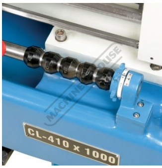
5 Position Adjustable Length Stop