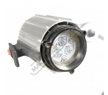
LED Worklight Close Up