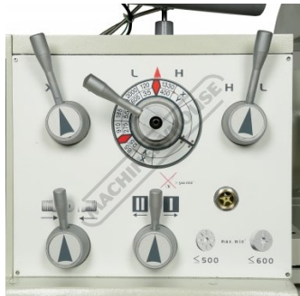
Spindle Speed Levers