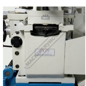
Hardened & Ground Bedways