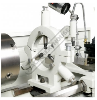
Fixed Steady With Roller Guides