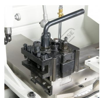
Quick Change Toolpost