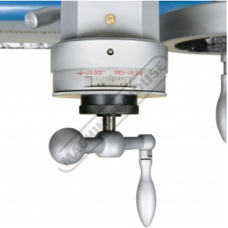
Cross Feed Dial In Imperial Mode