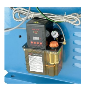
Auto Lubrication Pump