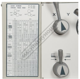
Thread and Feed Chart