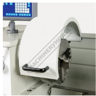
Chuck Guard With Micro