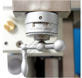
Compound Slide Dial in Metric Mode Compound Slide Dial in Imperial Mode Cross Feed Dial In Metric Mode