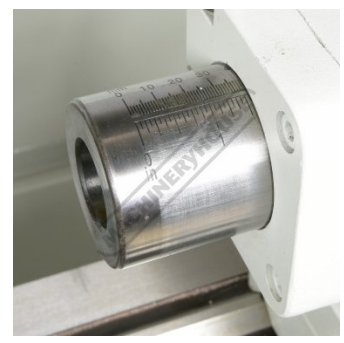
Tailstock Quill Graduations