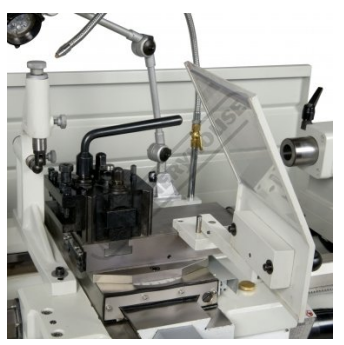
Saddle Safety Guard Shown Open Compound Slide