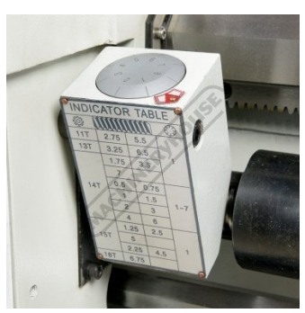
Thread Chasing Dial