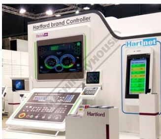
Hartrol Plus Large