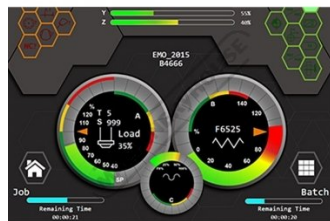
Hartrol Plus Main Screen