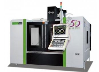
HCMC Hartrol Plus