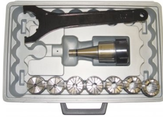
C962 Collet & Chuck Set - 9 Piece