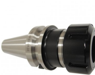
T226 BT40 x ER40-80 Collet Chuck