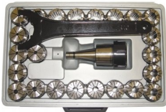
C966 Collet & Chuck Set - 25 Piece