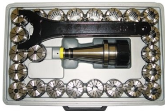
C967 Collet & Chuck Set - 25 Piece