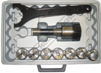
C961 Collet & Chuck Set - 9 Piece