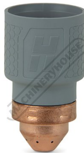
Mech Cartridge RFID Technology