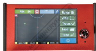
Touch Screen Interface