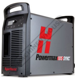
HYPERTHERM Powermax105 SYNC