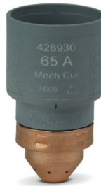
P8233 SmartSYNC™ Cartridge - 65A