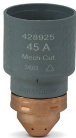
P8232 SmartSYNC™ Cartridge - 45A