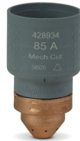
P8234 SmartSYNC™ Cartridge - 85A