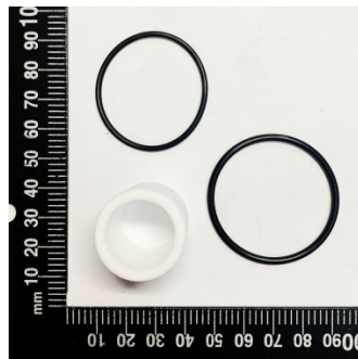
AP0001 Air filter element - Internal filter Powermax