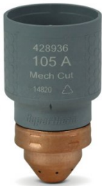
P8235 SmartSYNC™ Cartridge - 105A