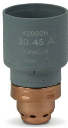
P8231 SmartSYNC™ Cartridge - FineCut©