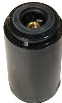
P8081 Hypertherm Eliminator Filter - Replacement filter element